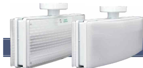
Example of mounting installation with convex diffuser